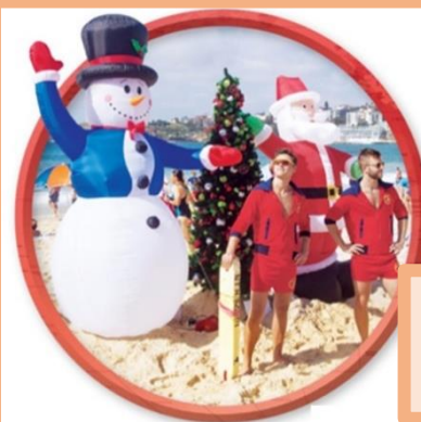
December in Australia