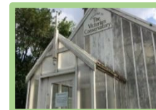
4) Animals removed from conservatory