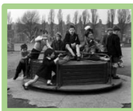
2) Playpark built